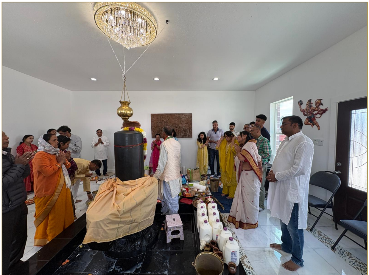
Maha Shivratri 2026 · SDKKM Temple