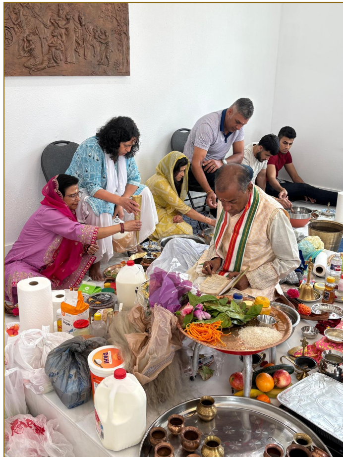
Maha Shivratri 2026 · SDKKM Temple