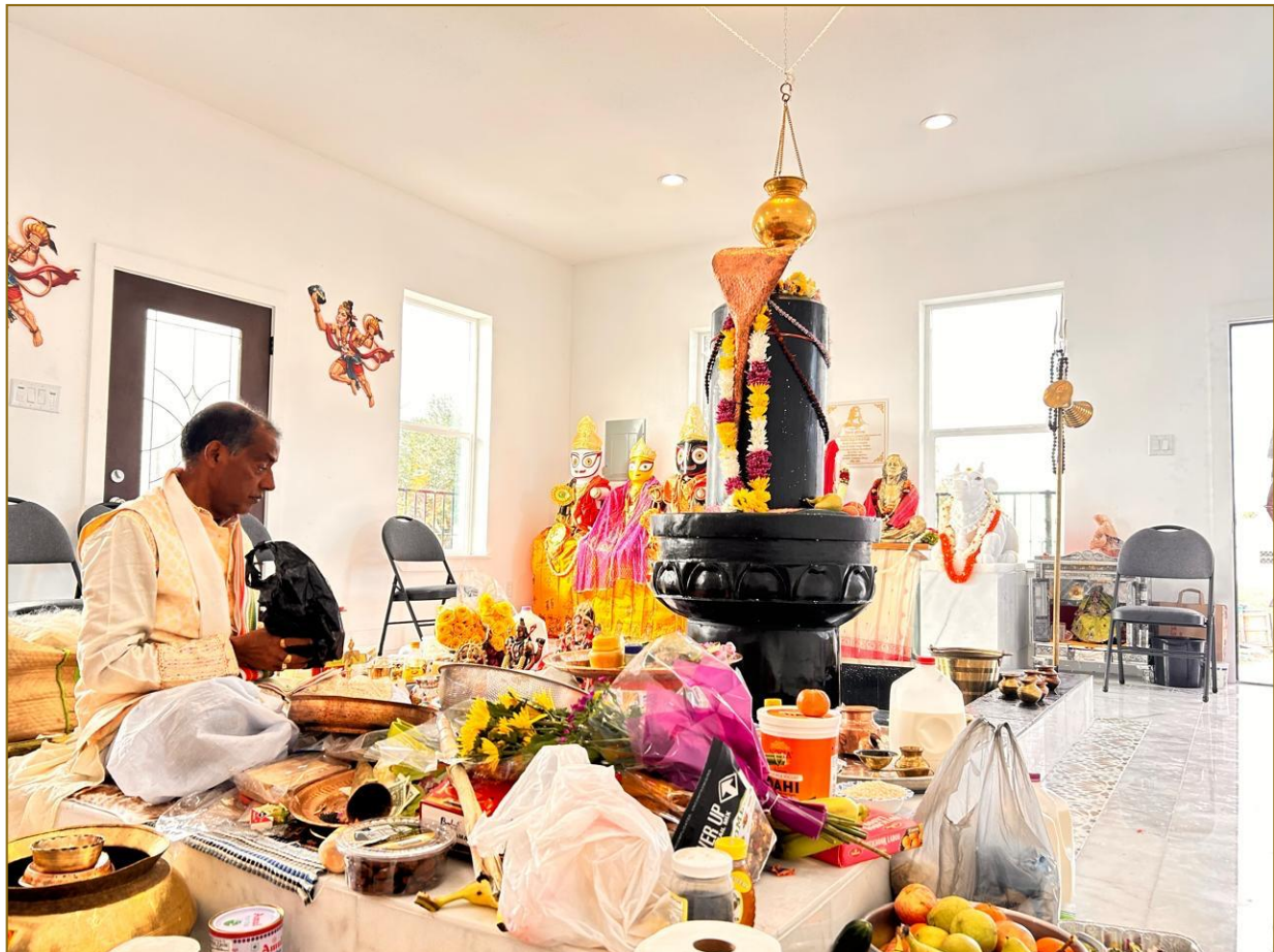
Maha Shivratri 2026 · SDKKM Temple