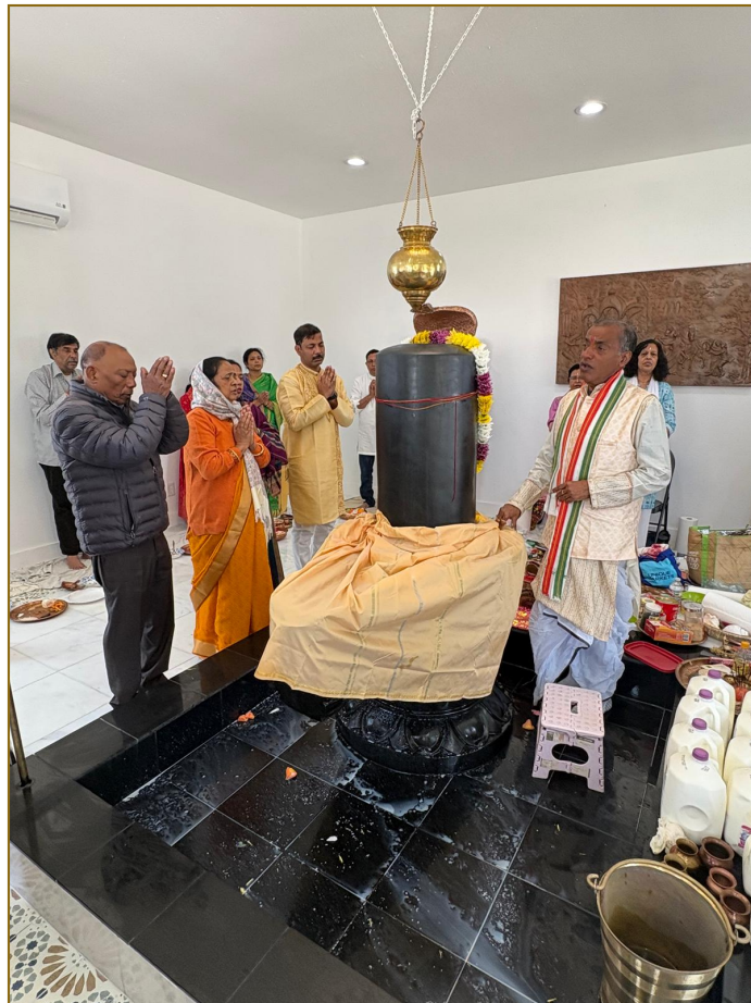
Maha Shivratri 2026 · SDKKM Temple