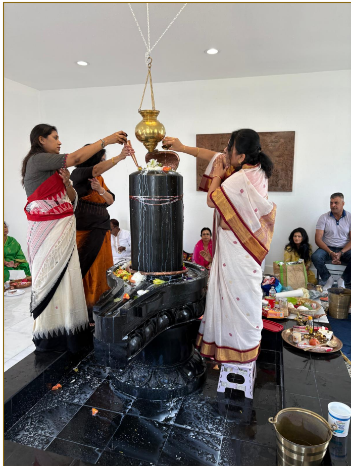
Maha Shivratri 2026 · SDKKM Temple