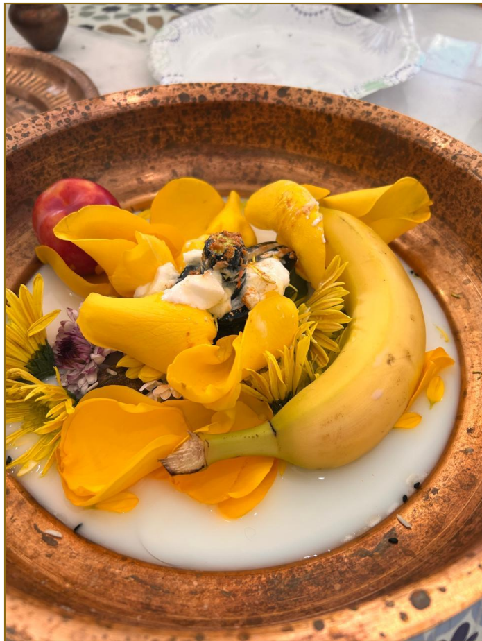
Maha Shivratri 2026 · SDKKM Temple